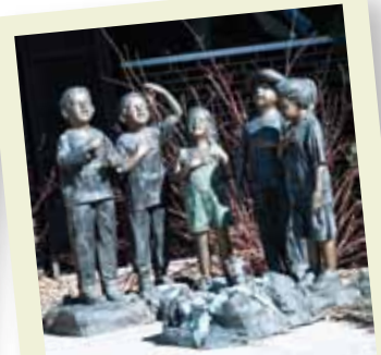
The Bronze Statue found a home!