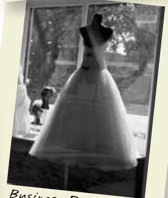
Business Development in Jefferson Park