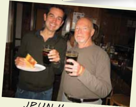
JPUN Happy Hour Strange Brew Sept 2011