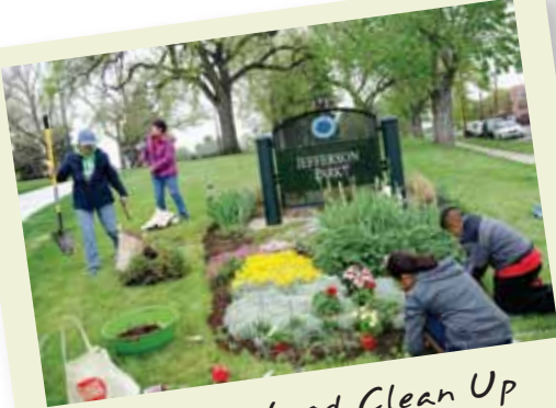
Neighborhood Clean Up May 2011