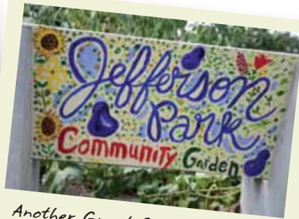
Another Great Growing Season