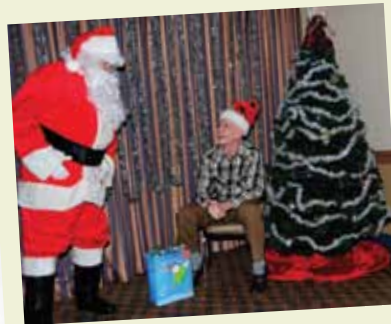
Naughty or Nice? 2010 Holiday Party