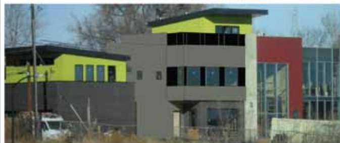
NORTH DENVER DESIGN/BUILD