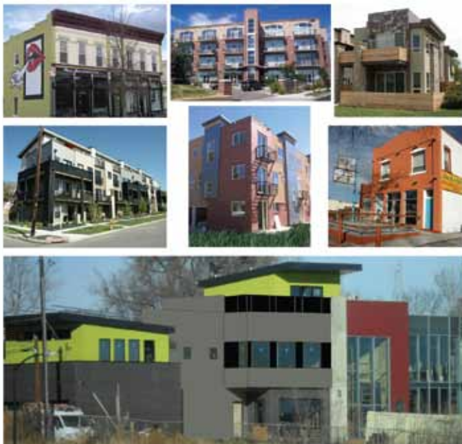
NORTH DENVER DESIGN/BUILD

REALARCHITECTURE UNREALCONSTRUCTION 2931 W. 25th Ave #101 Denver, Co 80211 Ph: 303 - 477 - 5650 www.realarchitecture.com