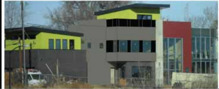
NORTH DENVER DESIGN/BUILD