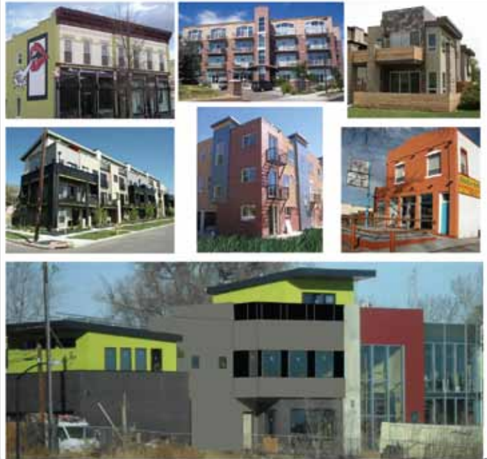
NORTH DENVER DESIGN/BUILD

REALARCHITECTURE UNREALCONSTRUCTION 2931 W. 25th Ave #101 Denver, Co 80211 Ph: 303 - 477 - 5550 www.realarchitecture.com