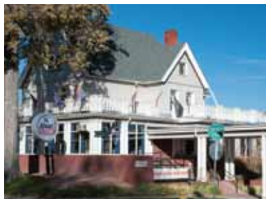
Adams Mystery Playhouse is located at 2406 Federal Blvd (Park and Enter on 24th Avenue). www.adamsmysteryplayhouse.com

Adams Mystery Playhouse has generously invited their Jefferson Park neighbors of all ages to enjoy a pre-Valentine's Day happy hour on Tuesday, February 8th from 5:30 – 7:30pm. Not only was the playhouse voted BEST THEATRE of 2010 by Denver's Channel 7 A-List, but the building is a Jefferson Park landmark that offers historical insights into our neighborhood's early beginnings. Come mingle with your neighbors & Adams Mystery actors while enjoying complimentary appetizers and drink specials, and learning about this Jefferson Park treasure.