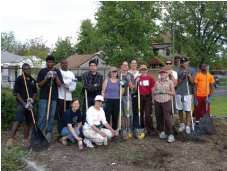
Groundwork Denver Green Team with Jefferson Park Community Gardeners at the start of last season.

One of Groundwork Denver's goals is to engage area youth, ages 14 to 24, in paid positions in the environment. In addition to activities such as community garden construction, summer employees complete a short internship at a national park. Send a cover letter resume to shane@groundworkdenver.org