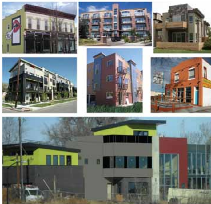
NORTH DENVER DESIGN/BUILD