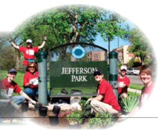
Jefferson Park United Neighbors