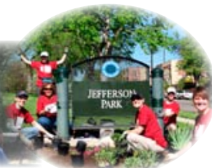
Jefferson Park United Neighbors