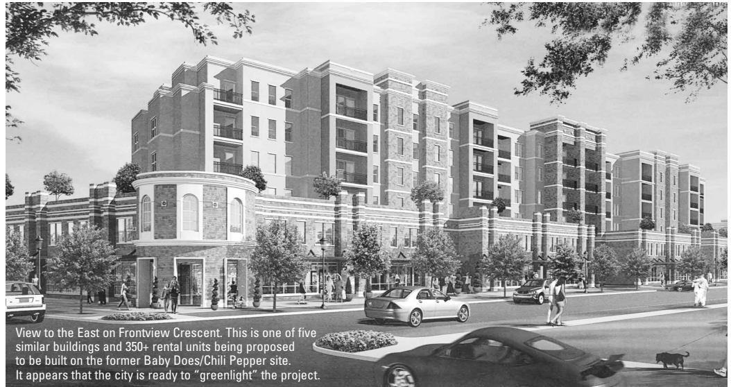
View to the East on Frontview Crescent. This is one of five similar buildings and 350+ rental units being proposed to be built on the former Baby Does/Chili Pepper site. It appears that the city is ready to "greenlight" the project.

Denver Recycles has completed cart deliveries to approximately 60% of participating customers in Denver and is thrilled that plans are to complete implementation of recycling carts to all customers by the end of 2006. Cart deliveries were completed for Phase 1 in October of 2005 and Phase 2 & 3 in June and July of 2006. The final two phases (Phases 4 & 5) are scheduled for cart deliveries in the fall of this year. Residents in Phases 4 & 5 can assist in the cart delivery process by keeping an eye in the mail for an informational postcard mailed to you a few weeks prior to cart delivery. Residents may check their scheduled delivery day on-line at www.DenverGov.org/DenverRecycles or call 720-865-6815.